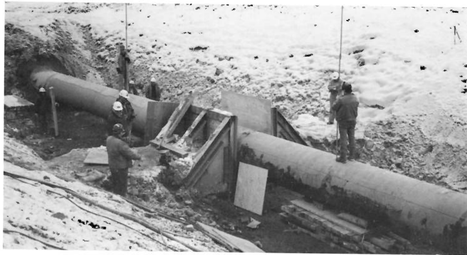
Airbags like the one at the extreme lower right of this photo were used to level the pipe. Surveyors measured the position of the pipe during releveling, and lateral restraints kept the pipe from slipping sideways during the operation.

The curvature was discovered using new pigging technology that measures pipeline curvature. Analysis of the data from the June 1992 Nowsco pig run